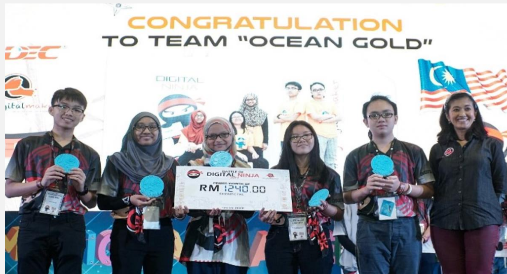
Digital Ninja from SMK Bau won 2nd Runner up at Battle of Digital Ninja 2019

Digital Ninja is a leadership and digital making skills enhancement program targeted at Malaysia's best and brightest young digital innovators aged 11-17.