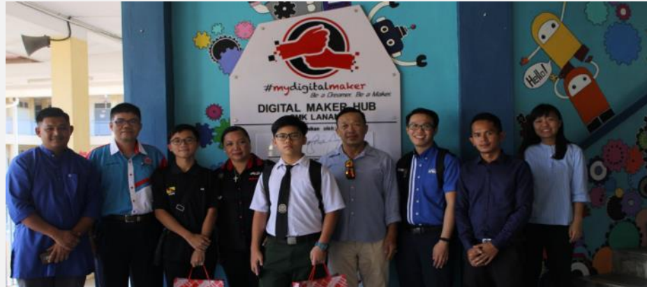
Hosting of visit from SMK Mukah to benchmark and learn best practices in hosting a Digital Maker Hub

Champion schools are public schools that act as nucleus to support neighbouring schools in cultivating digital creativity and innovation.