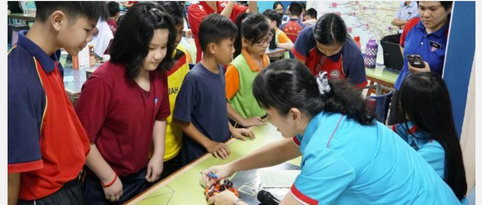
Robotics outreach programme with primary school students from surrounding areas. Participated by SJKC Thai Kwang, SJKC Kiew Nang, SK SEDC, SK Nanga Assan dan SK Tanjung Latap