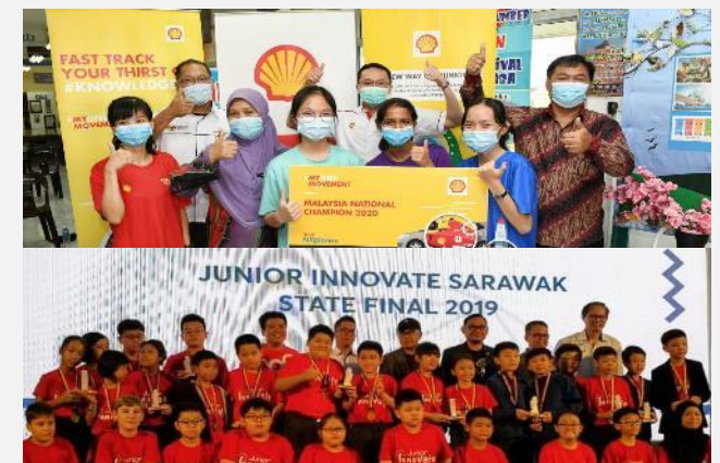
Competitions: Shell #MyGeekMovement (SMK Lutong, Miri as national Champion in 2020), Junior & Young Innovators Challenge