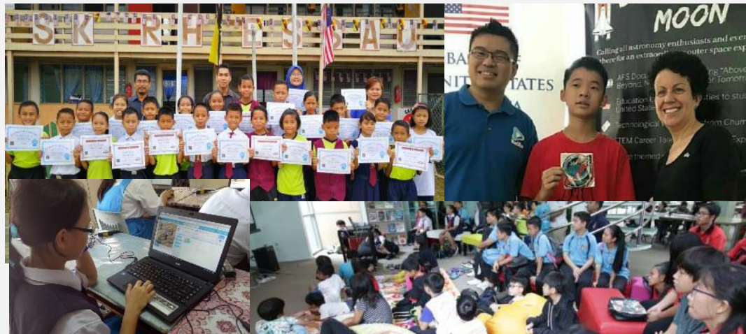
Outreach Programmes: Hour of Code Campaign, Beyond the Moon 2019

In collaboration with ecosystem partners